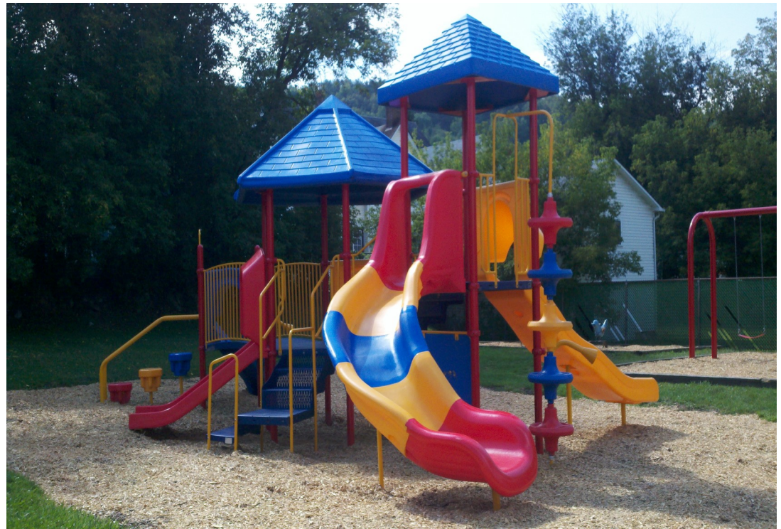
Vine Street Playground