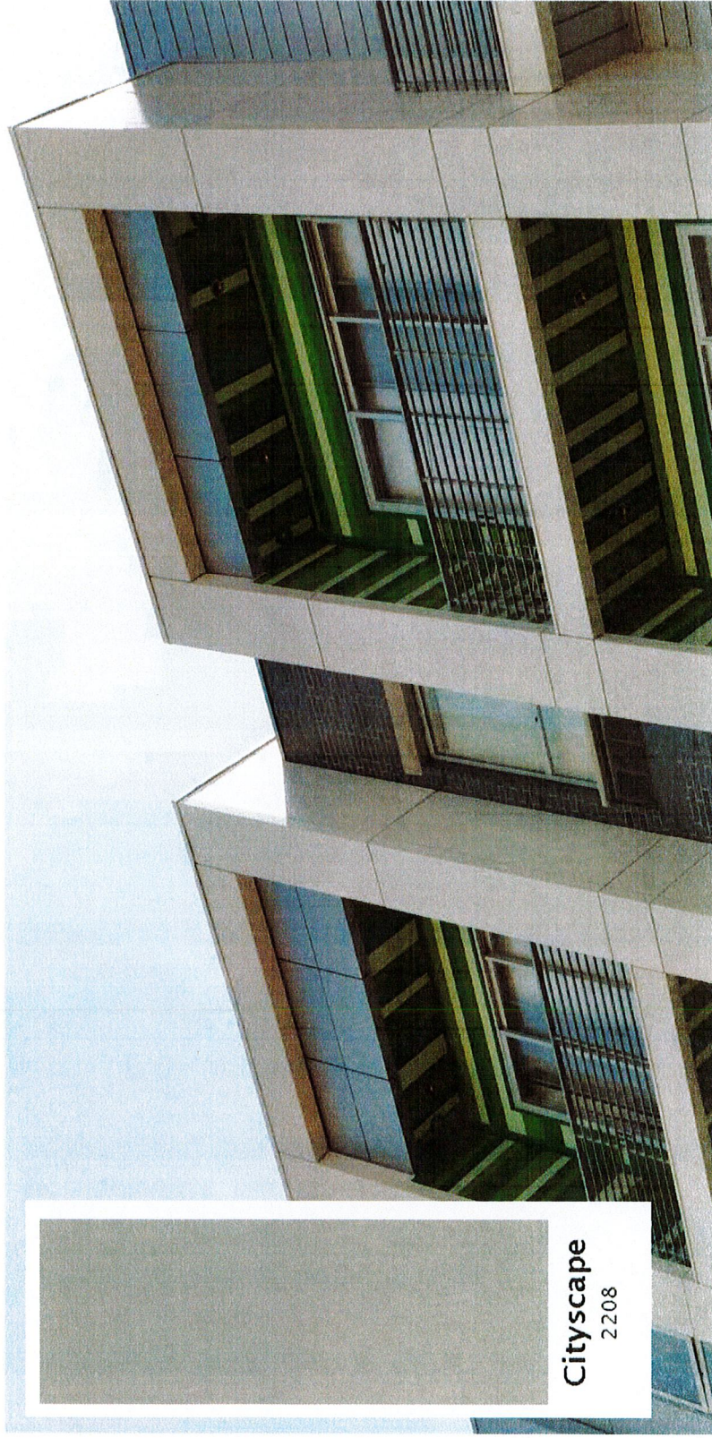
94 North Main Street - Exile On Main Street - Material Color Chart

Metal - chosen for durability and aesthetics. Color choice is roughly the shade of Barre Gray granite.