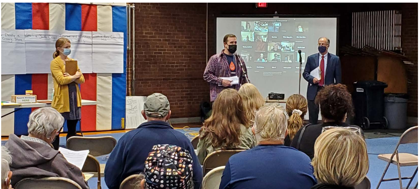
On Sept 29 th , participants joined in person and online to narrow the list of priorities for community action.